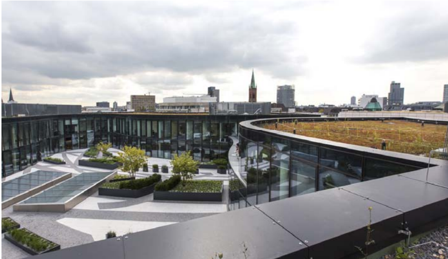
The courtyards are stylishly decorated with linear patterns and a variety of flower beds in different sizes, depths and geometric shapes.