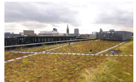
Pre-cultivated vegetation mats were applied along the edges whereas the centre of the roof surface was planted with Sedum sprouts.