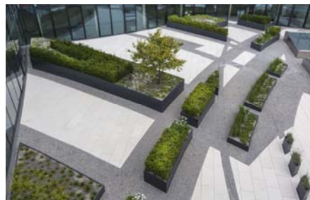
Fixodrive® FX 50 is hidden below the dynamically designed pattern.