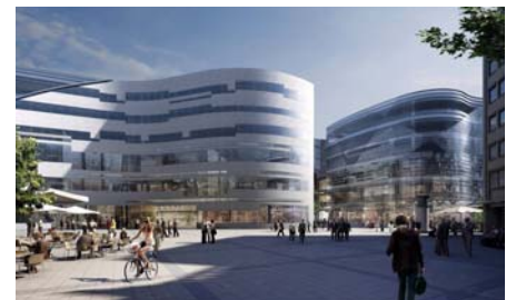
In March 2014, the Kö-Bogen was awarded the prestigious MIPIM Award in Cannes in the category "Best Urban Renewal Project".