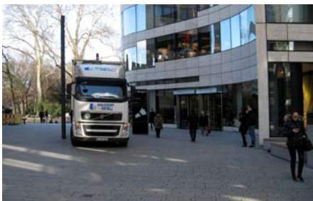
Since vehicles such as delivery trucks and fire engines are meant to pass the forecourt, the build-up needed to be planned in a way it supports heavy loads.