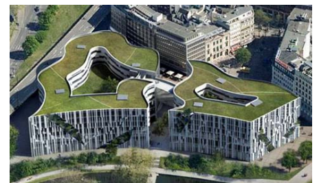
On the approximately 4.000 m 2 large roof surface the Floraset® FS 50 drainage element was installed. These elements are particularly suitable for large roof areas with little inclination and long drainage distances.